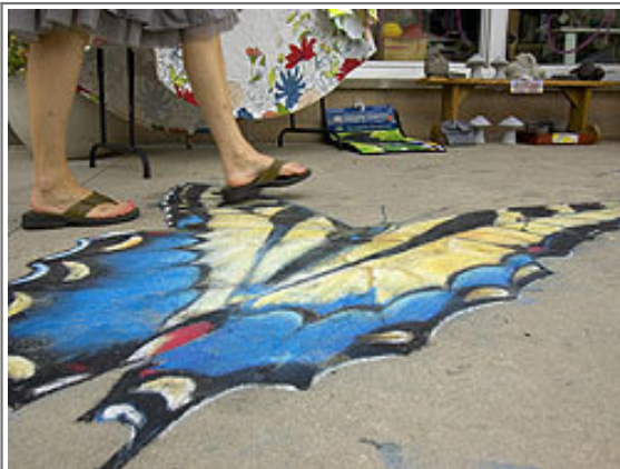
Curiosities on Wortlev Rd. in London has a

This year's festival will attract passersby to a parking lot on Bruce St., with the street paintings of 42 artists, and an area for kids to create their own masterpieces.